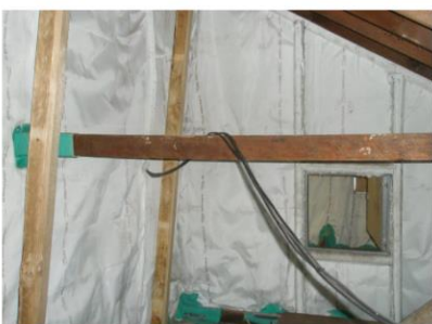
Department of Housing NSW

This easy to install flexible fire barrier is used as a fire engineered solution to continue compartment walls up into the roof void, maintaining both the integrity and insulation of the compartmentation between dwellings, lift shafts and stairwells, ideal for but not limited to strata units. Firefly Plus 60 can also be used to provide inside out / outside in fire protection to boundary walls on both steel and timber framed buildings. The flexibility and fire rating level makes this product perfect for bespoke applications.