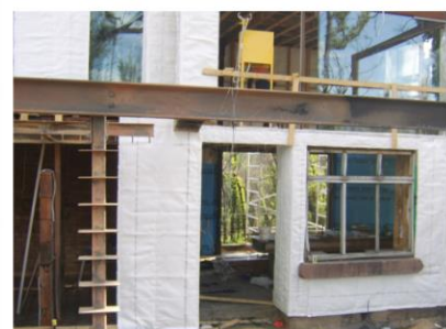
Callignee II Victoria Flame Zone Construction