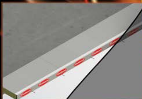
RAINBAR 60 PLUS Between Slab edge and Glazing