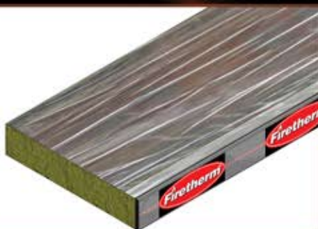
RAINBAR 60 PLUS

RAINBAR 60 PLUS LARGE SLAB EDGE CAVITY CLOSER